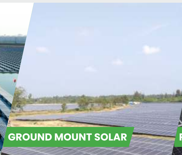
GROUND MOUNT SOLAR